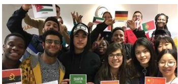
International food Evening