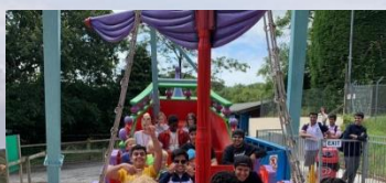
Woodlands Theme Park